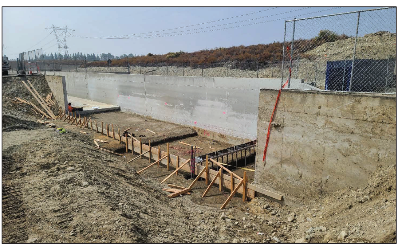
Lower Day – Demolished section of channel to prepare for new gate