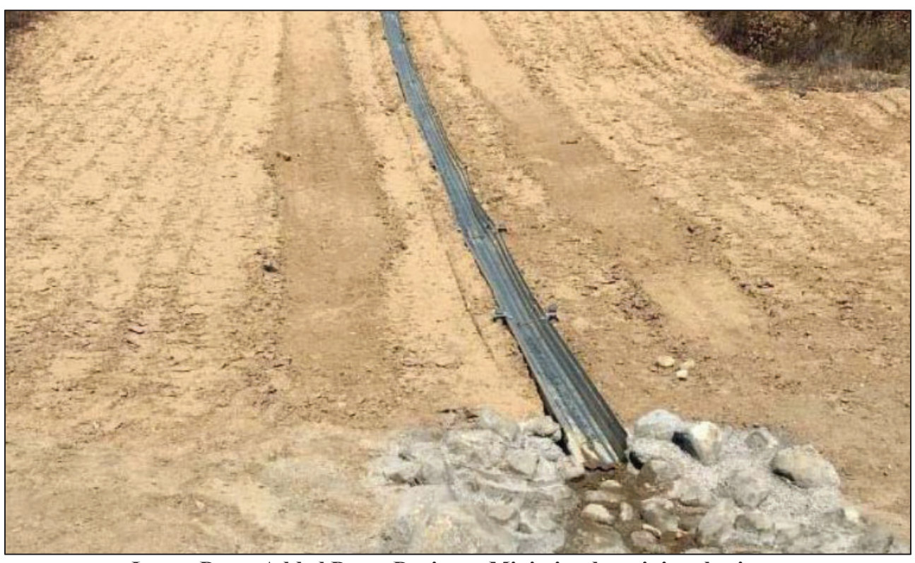
Lower Day – Added Down Drains to Minimize deposit into basin