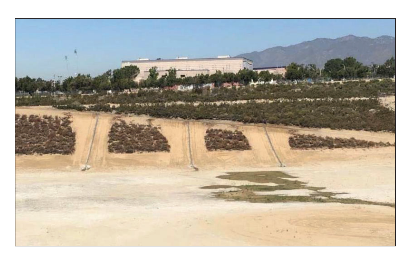
Lower Day – Down drains