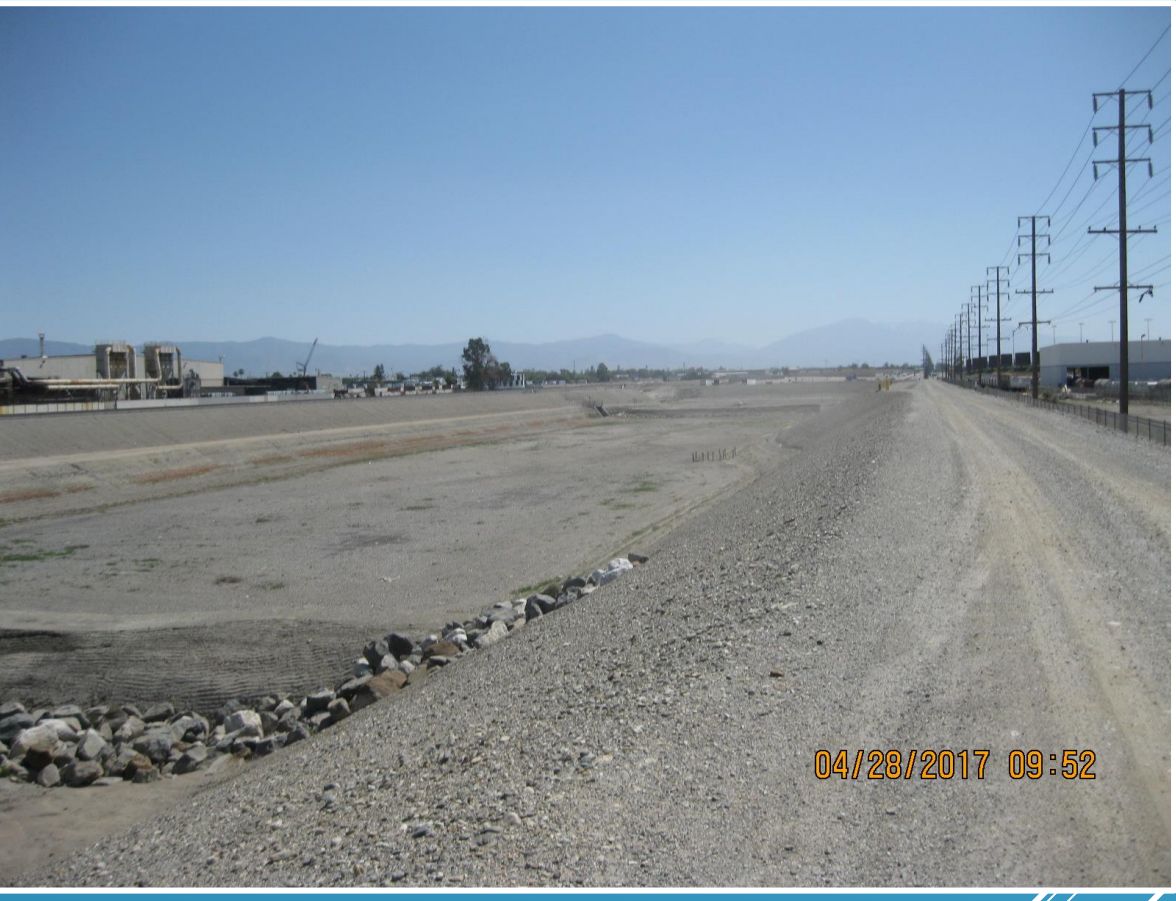
Hickory Basin East looking SW