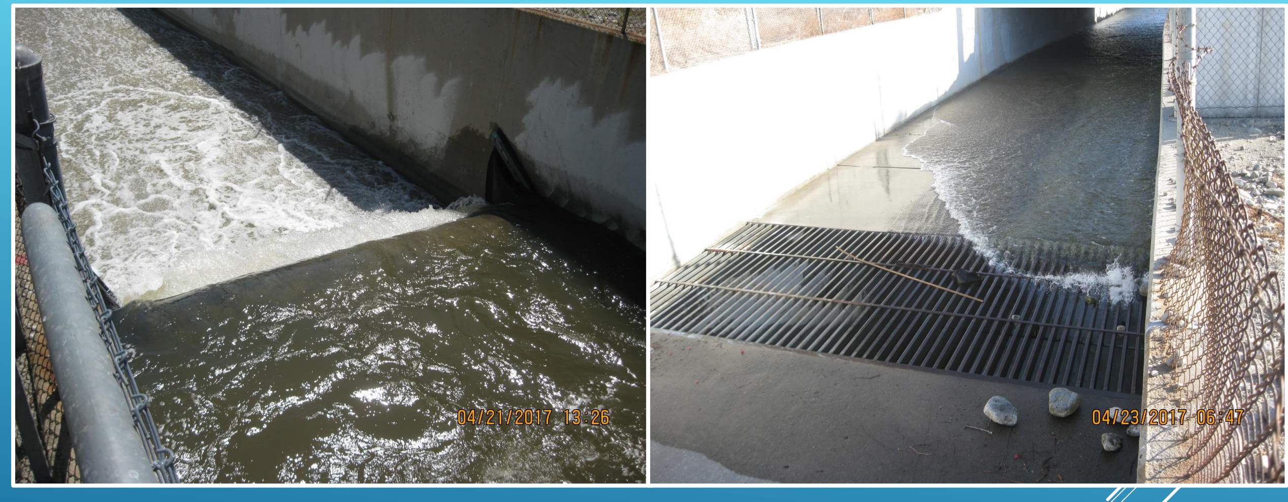
Imported Water at College Heights Rubber Dam