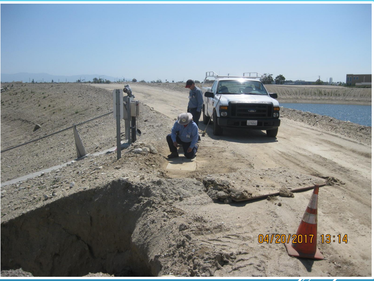
Pushing water Out of Communications Conduit at Turner 4A