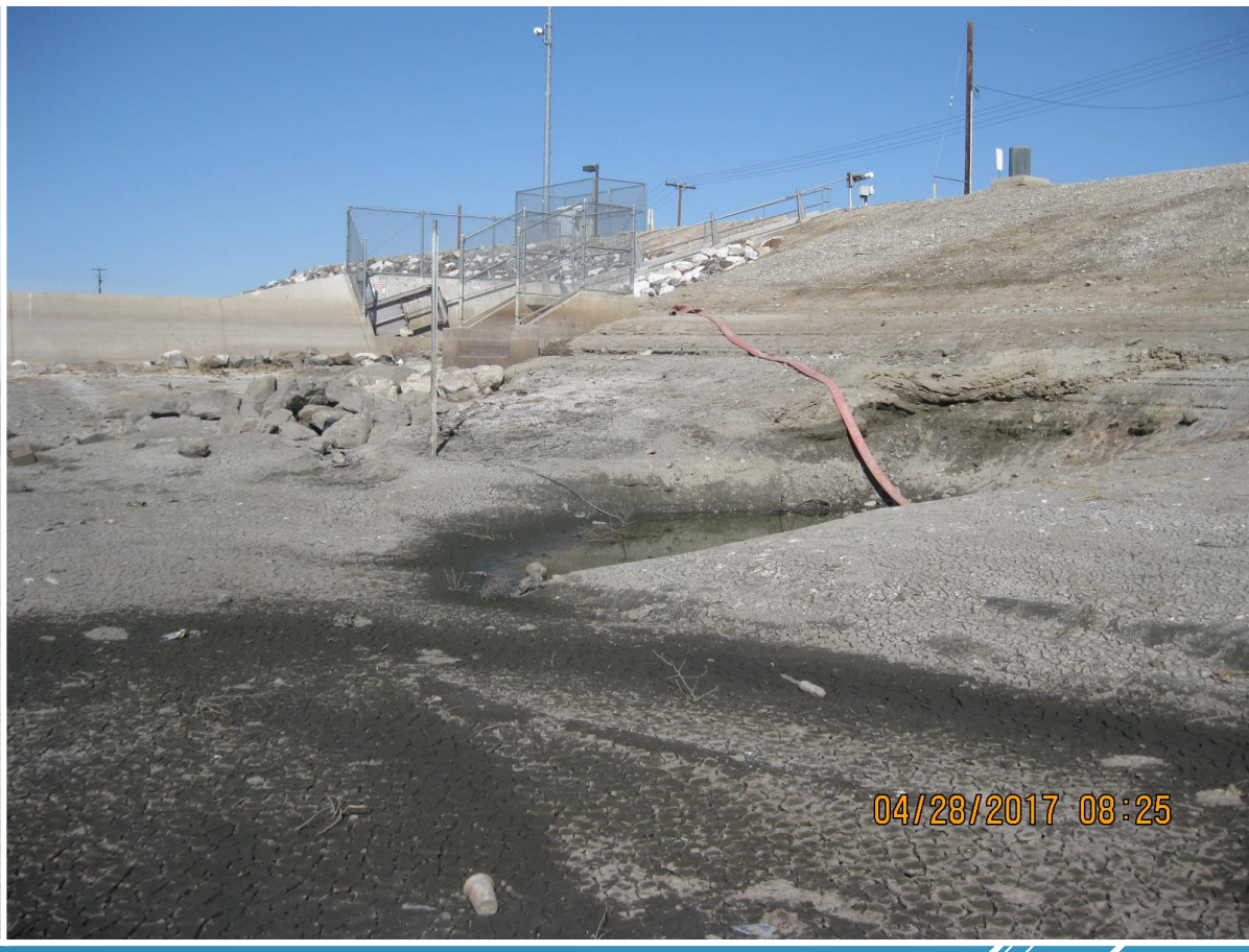
Banana Basin looking SW