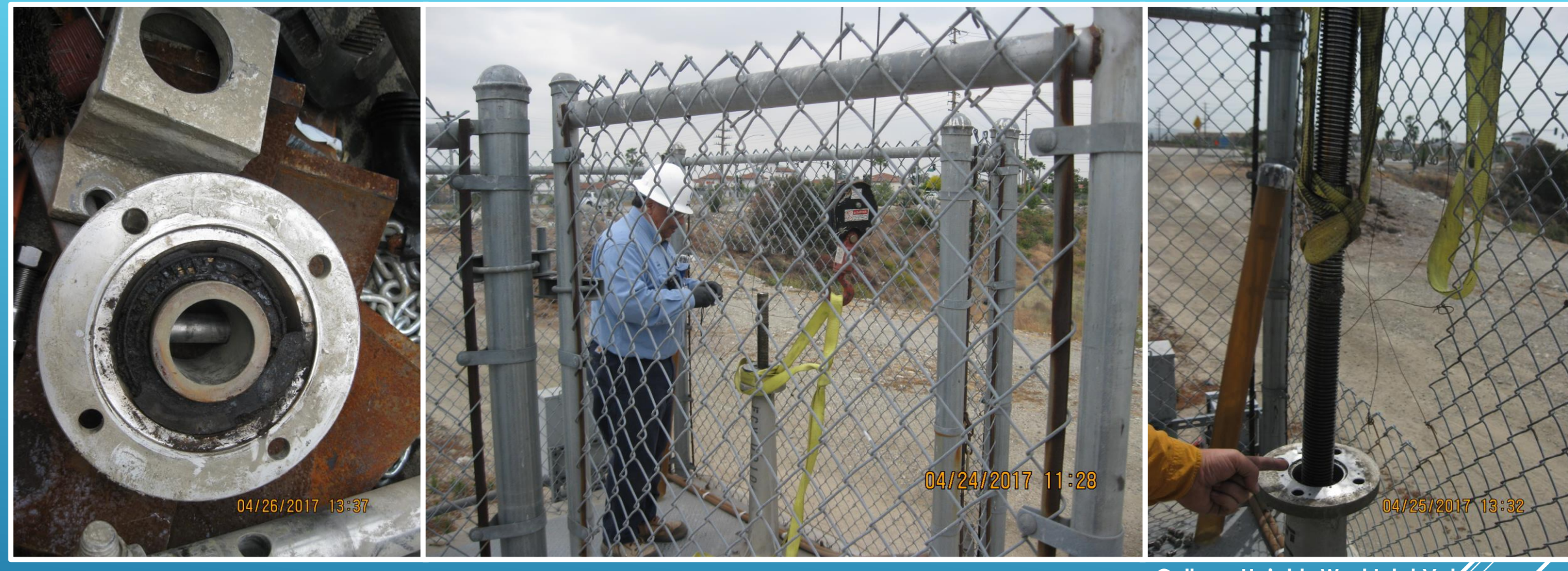
Failed Shaft Bearing from Declez Basin