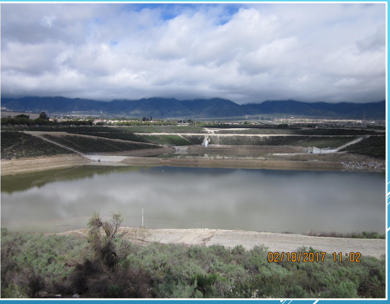
Night Storm Response to Lower Day Basin for Manual Readings