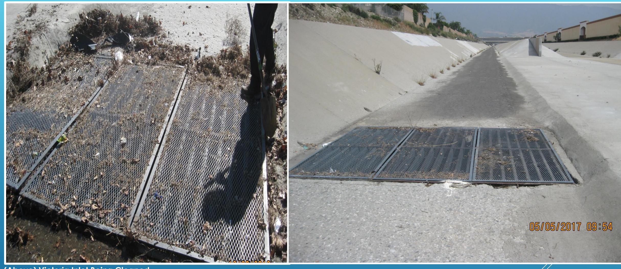
(Above) Victoria Inlet Being Cleaned (Below) Victoria Inlet Missing Mesh Panel