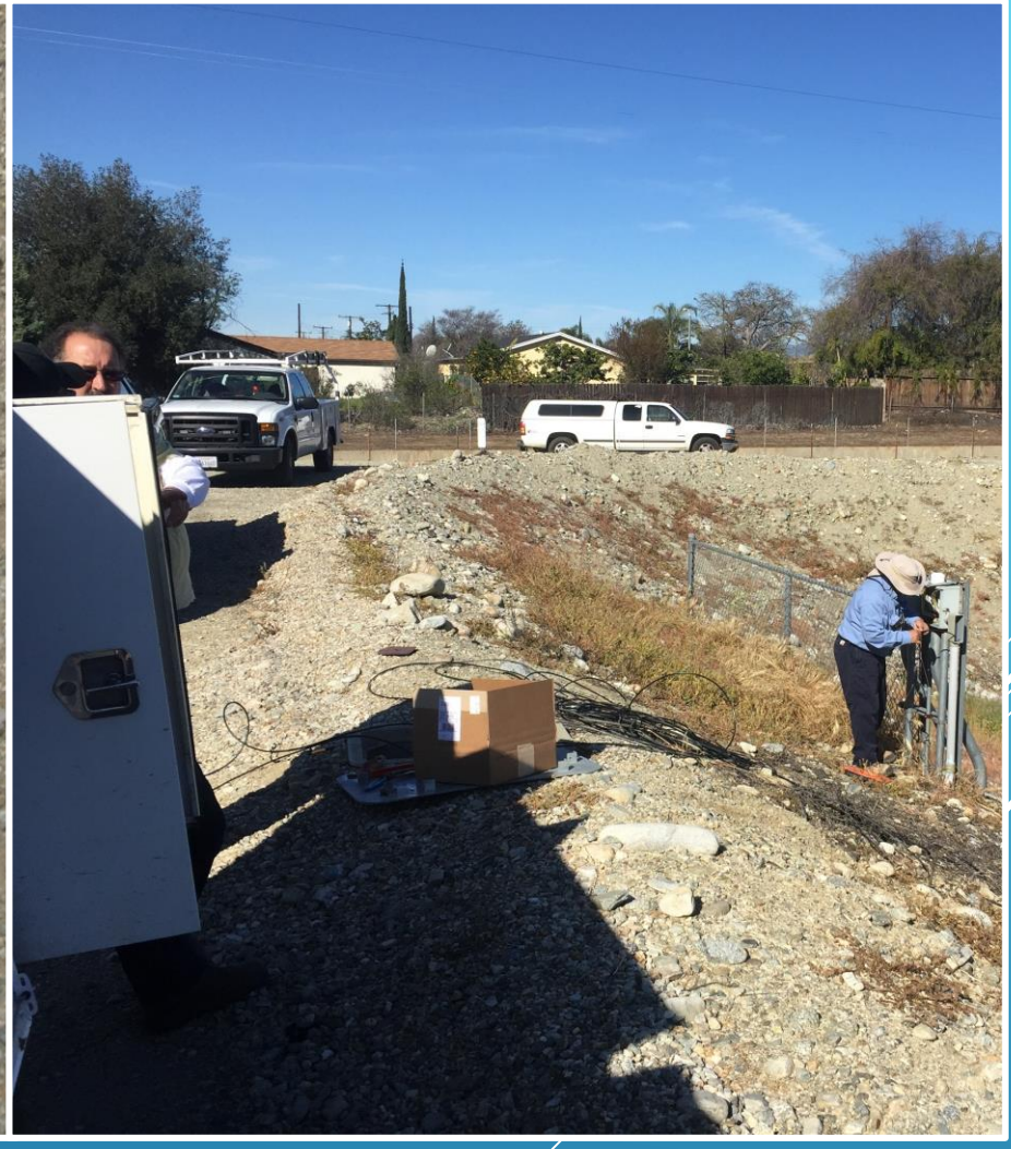
Montclair 2 preparation for insertion