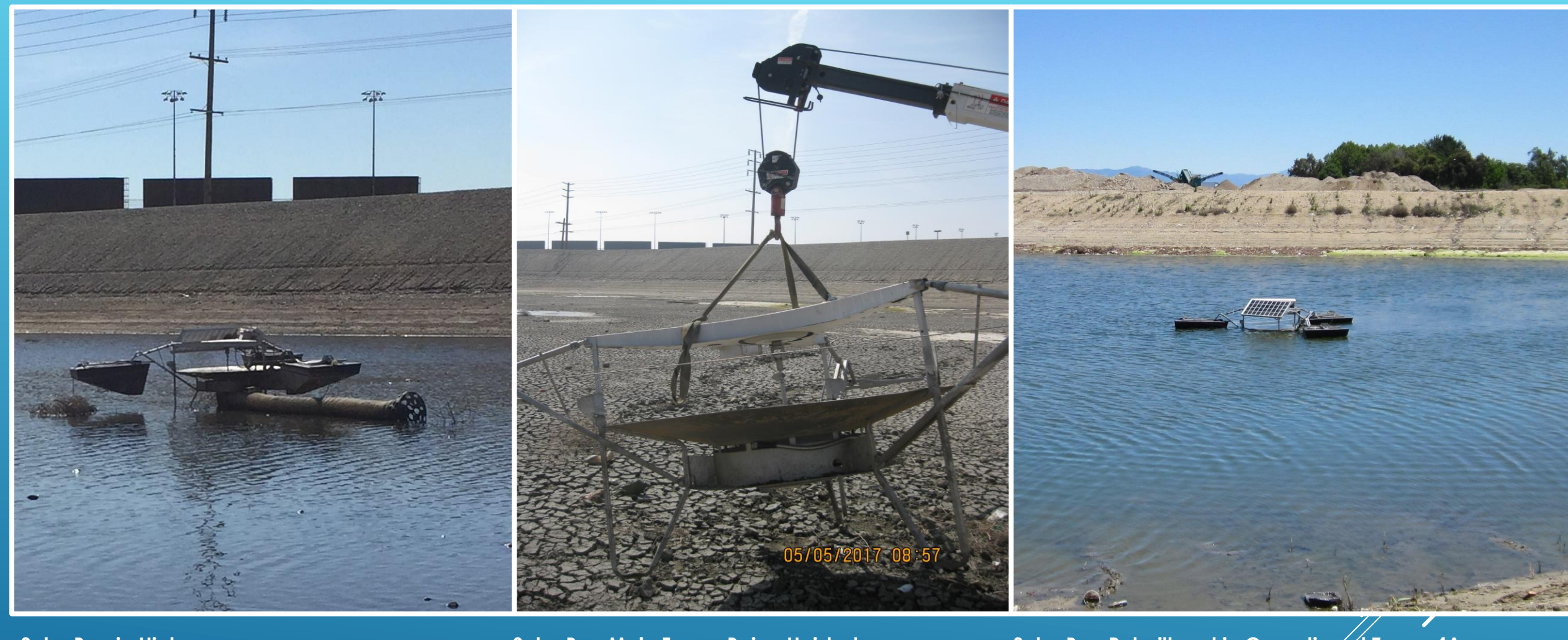
Solar Bee in Hickory