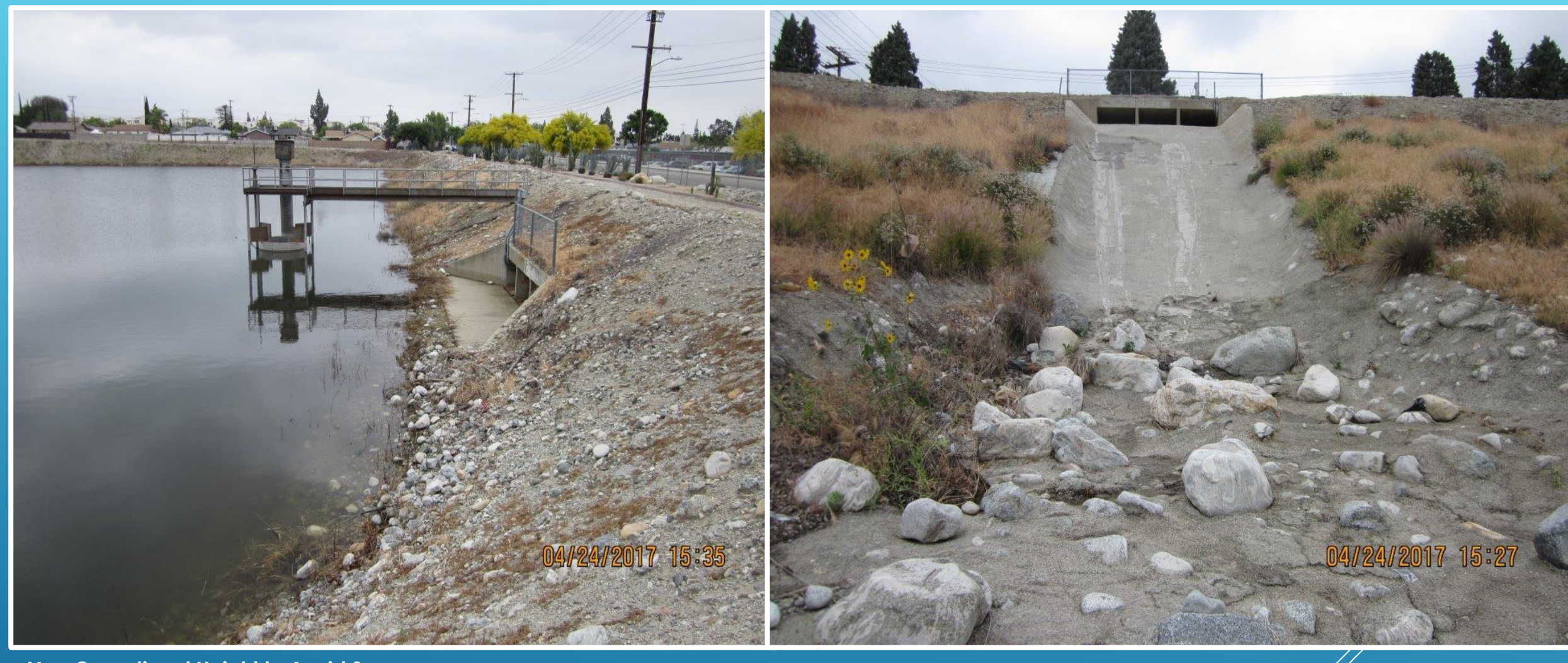
Max Operational Height to Avoid Seepage