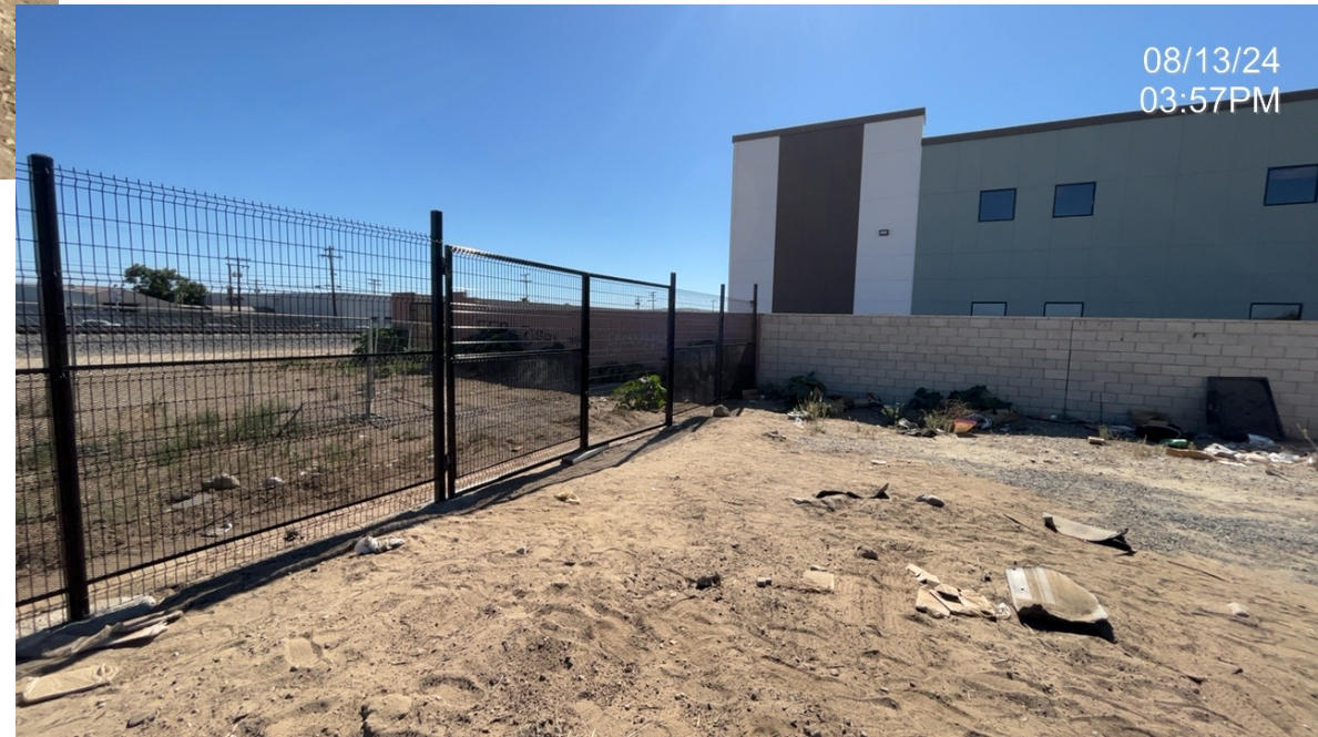
District/RR property line