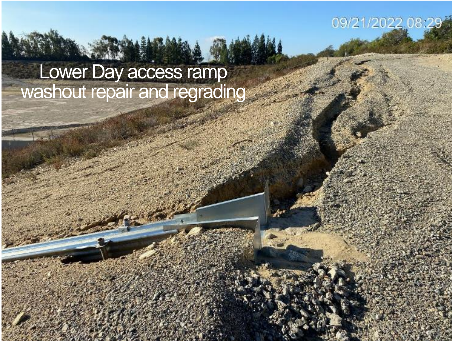
Lower Day access ramp washout repair and regrading