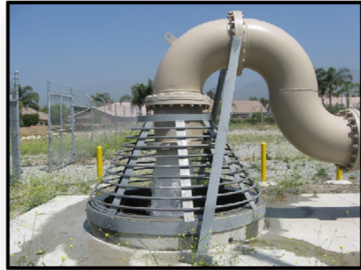
CB20 Outlet while in use