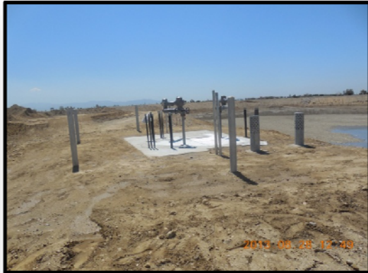
Construction of Junction Structure