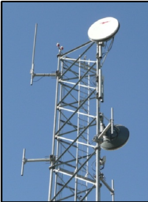
Basin Communication Tower