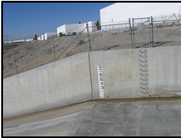
Berm removed and channel cleaned (12/03/13)