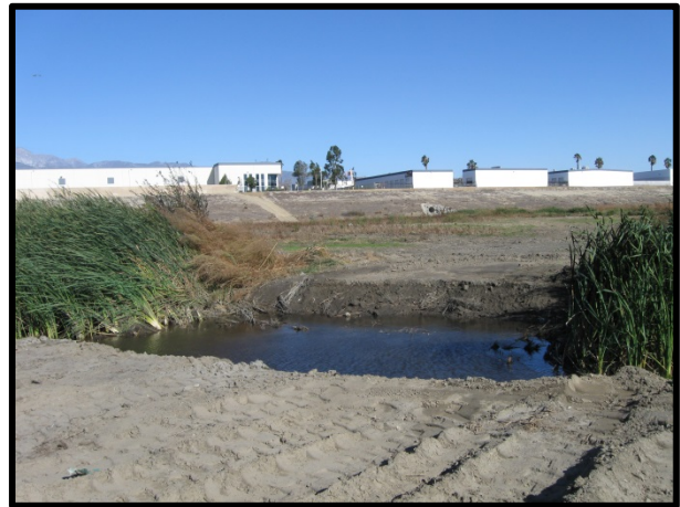
Access roads removed and basin restored to original (12/03/13)