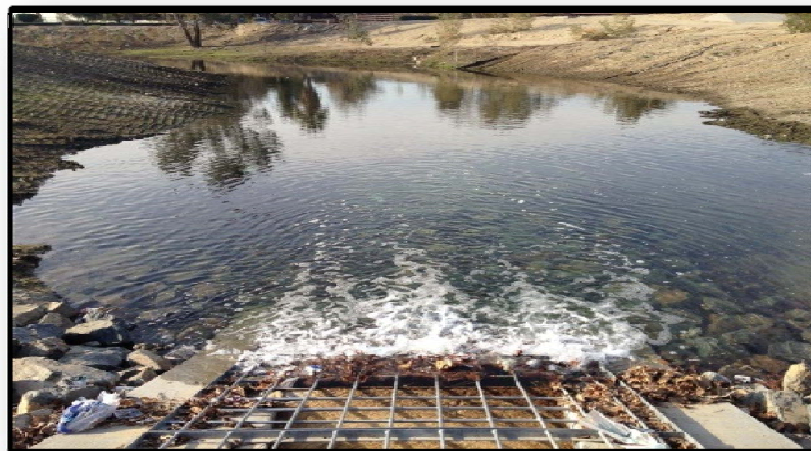
Installed 60-inch connection pipe into Basin 8 Junction Structure