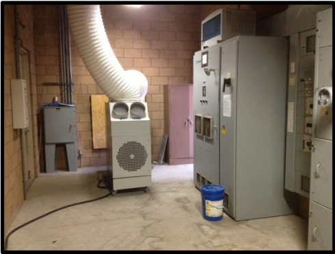
MCC Control Panel