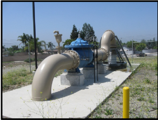
CB-20 Turnout Facility