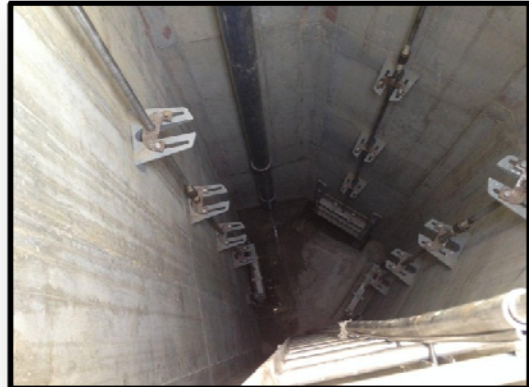
Inside the Completed Junction Structure