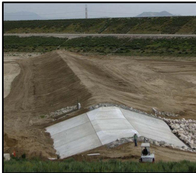
San Sevaine Basin 5 - Berm