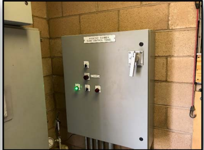
Rubber Dam control panel