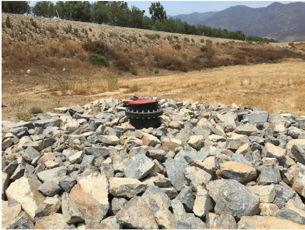
Completed Stormwater Outlet Structure in Basin 3