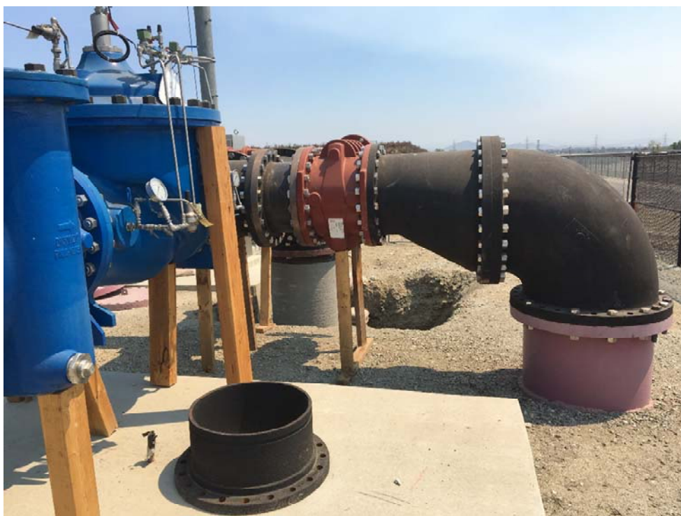
Installation of new pipe fittings at the Recycled Water Turnout