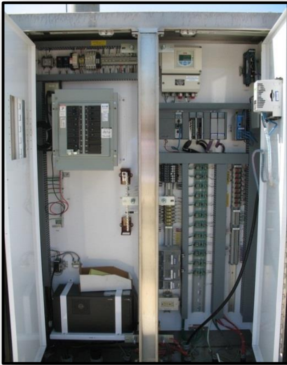
San Sevaine Turnout control panel