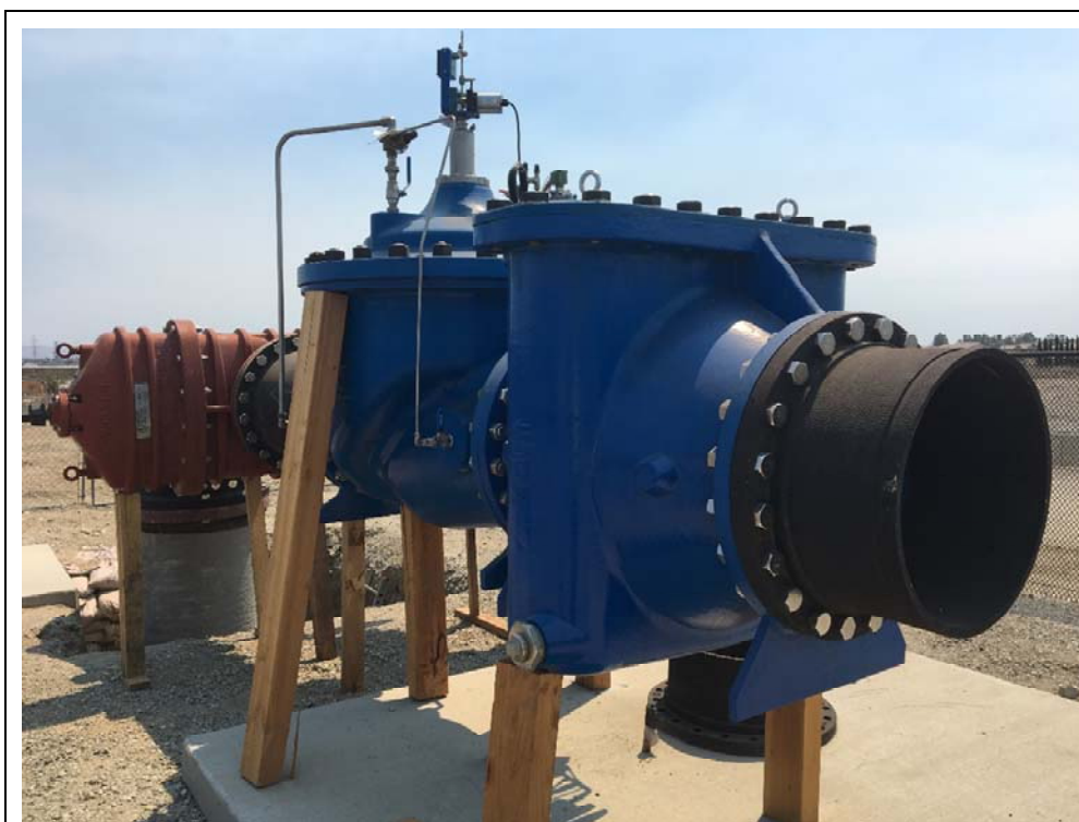
Installation of new strainer and control valve at the Recycled Turnout