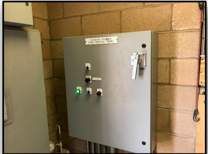
Rubber Dam control panel