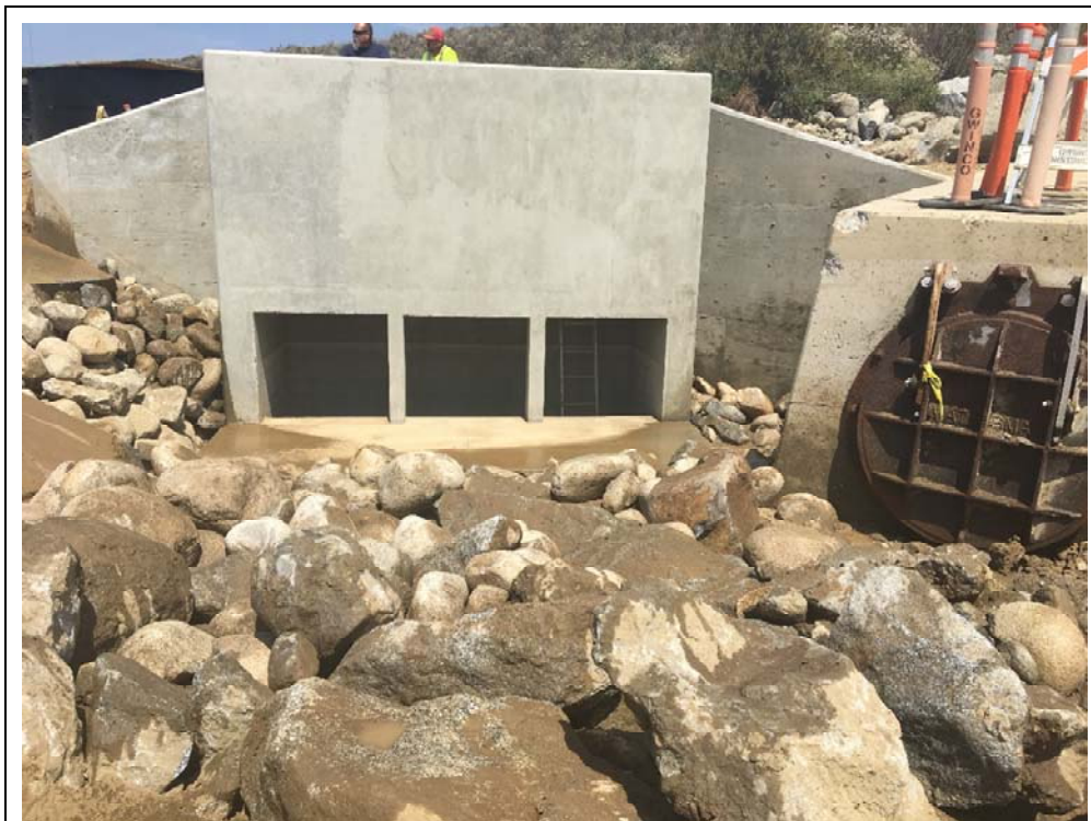
Installed new stormwater inlet structure