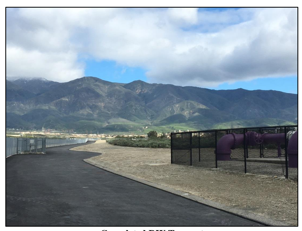
Completed RW Turnout