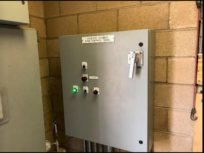
Rubber Dam control panel