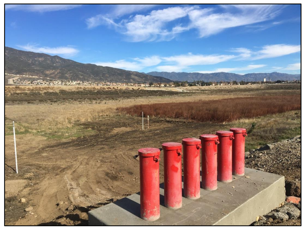
Completed Lysimeter System at Basin 2