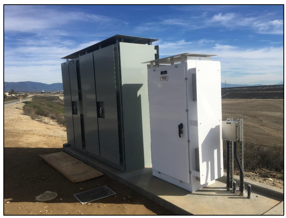
Completed Pump Control Panels