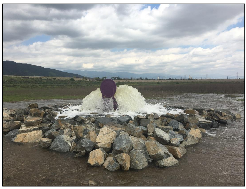
Full operation of pump system - Outlet Structure in Basin 2