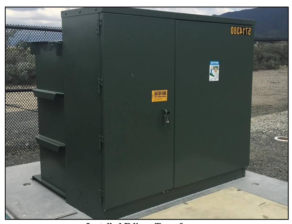
Installed Edison Transformer