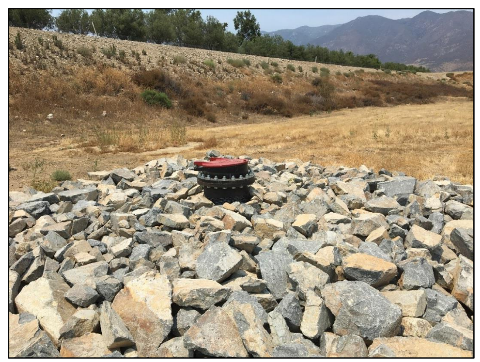
<u>Completed Stormwater Outlet Structure in Basin 3</u>