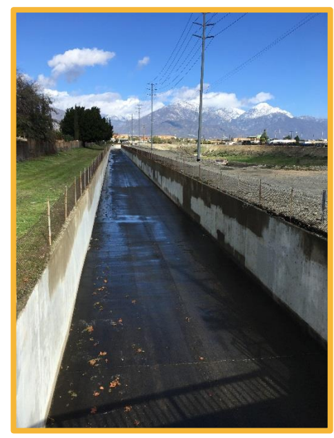
Channel (Montclair 3)