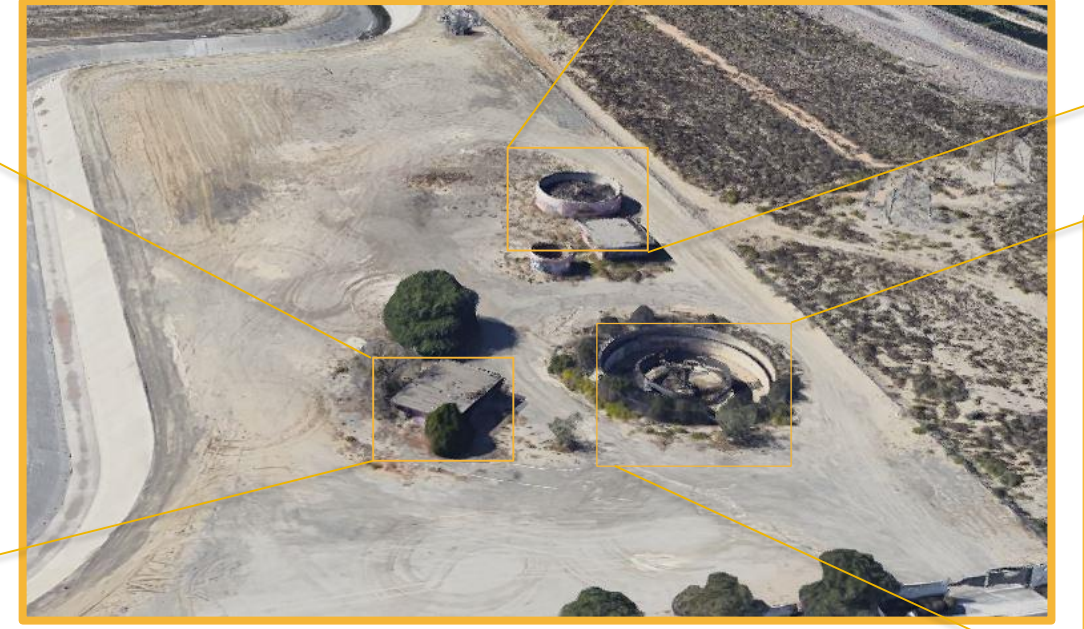
Aerial of Remaining Abandon Structures