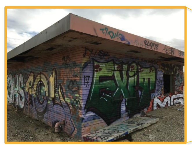
Abandon Pump Building