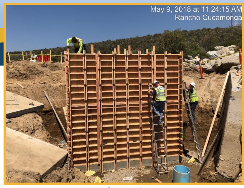
Inlet Structure Basin 5