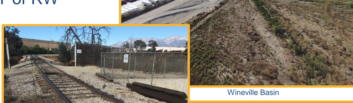
Rail Road Spur - Pipeline

Awaiting review comments from Flood Control District Inland Empire Utilities Agency