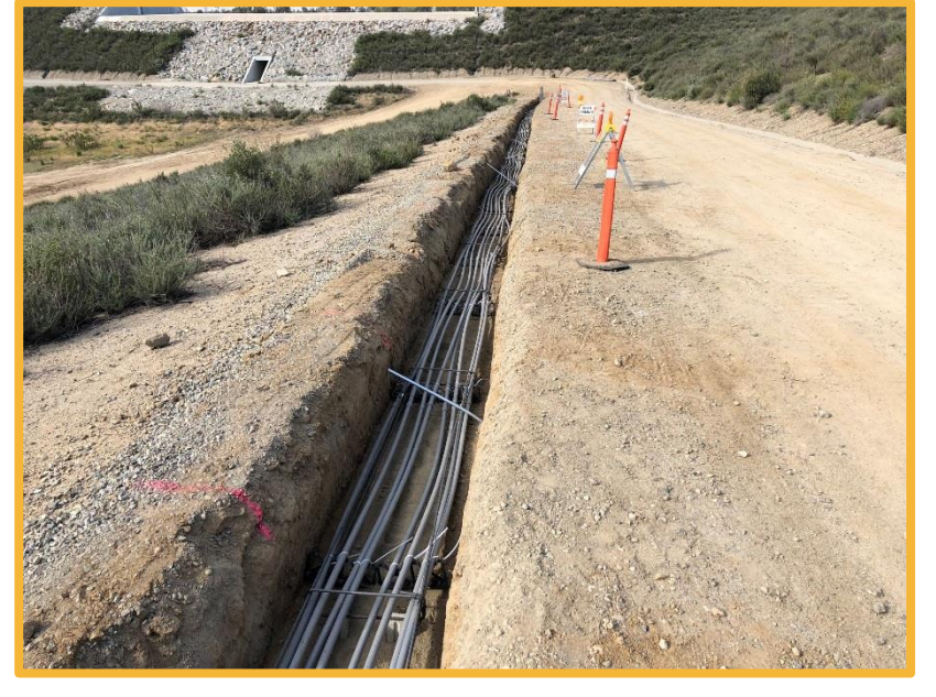
Installed Conduit along Access Road to Basin 5