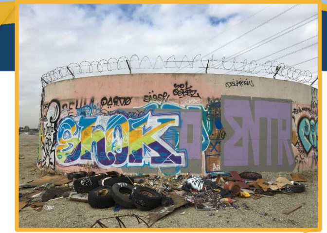
Abandon Treatment Tank