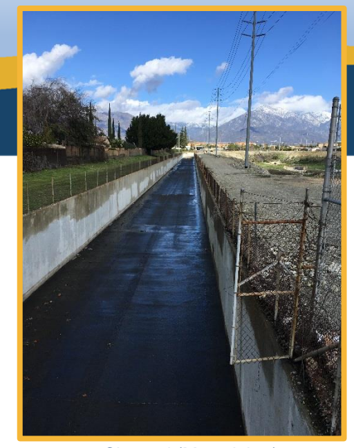
Channel (Montclair 2)