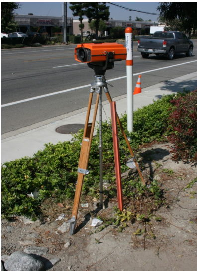
MZ-1 Monument Construction & Surveying

With regard to monitoring and testing, Watermaster began or continued the implementation of some of these activities called for in the MZ-1 Plan. During this reporting period these activities included: