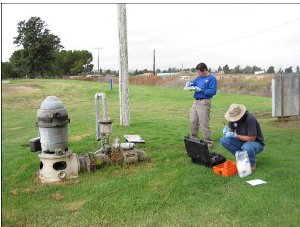
Watermaster field staff collecting samples for water quality monitoring

Water Quality and Quantity in Recharge Basins. Watermaster measures the quantity of storm and supplemental water entering the recharge