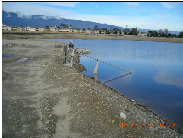
December Storm at Victoria Basin