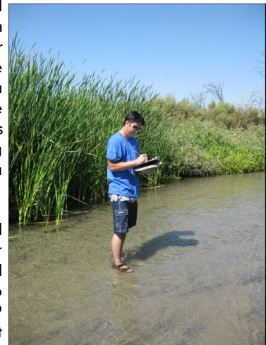
Santa Ana Sucker Habitat Survey

Pursuant to the Basin Plan and the Watermaster/IEUA permit to recharge recycled water, Watermaster and IEUA have conducted groundwater and surface water monitoring programs since 2004. During this reporting period, Watermaster measured 414 manual water levels at private wells throughout the Chino Basin, conducted two quarterly downloads at the 43 wells containing pressure transducers, collected 49 groundwater quality samples, 154 surface water quality samples, and 40 direct discharge stream measurements. Quarterly Surface Water Monitoring Program Reports that summarize data collection efforts were submitted to the RWQCB in July and October of 2010.