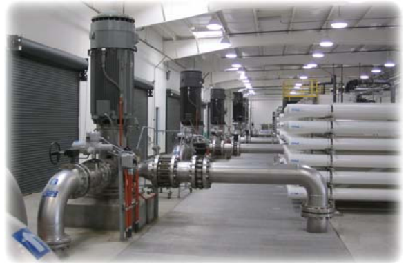
Chino II Desalter Treatment Facility

The preferred plume remediation alternative identified in the Draft Feasibility Study and RAP involves the use of existing and proposed CDA production wells and facilities. The RP-1 Parties reached a Joint Facility Development Agreement with the CDA for implementation of a project designed to remediate the South Archibald Plume. The proposed project includes the operation of three new CDA desalter wells (II-10, II-11, and II-12), and a dedicated pipeline to convey produced groundwater from the three new wells and existing CDA well I-11 to the Desalter II treatment facility. The Draft Feasibility Study and RAP will be finalized based on regulatory input from the Regional Board, and comments from the public and other stakeholders.