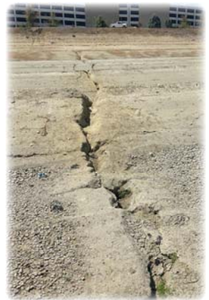
Fissuring at Ely Basin 3