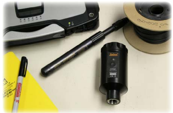
Pressure Transducer Equipment Before Installation

All groundwater-level data are checked by Watermaster staff and uploaded to a centralized database management system that can be accessed online through HydroDaVE SM . During this reporting period, Watermaster measured 419 manual water levels at 90 private wells throughout the Chino Basin, and conducted two quarterly downloads at about 130 wells containing pressure transducers. Additionally, Watermaster compiled all available groundwater-level data from other parties for the April to September 2015 period.