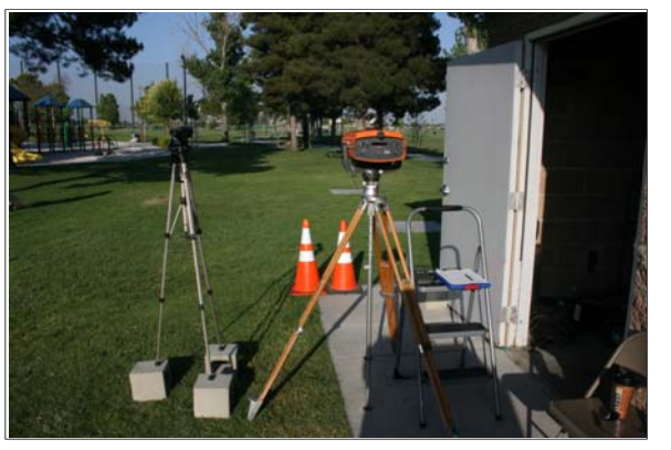
MZ-1 Monument Construction & Surveying