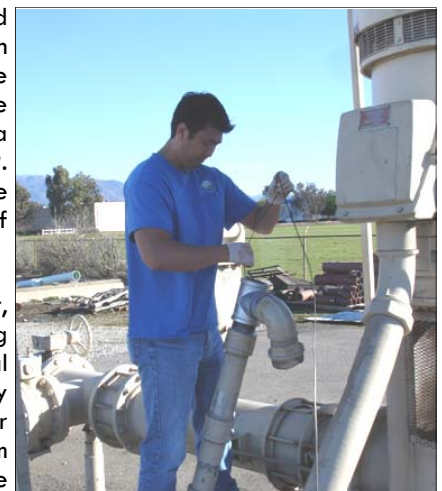
Installing a pressure transducer

Pursuant to the Basin Plan and the Watermaster/IEUA permit to recharge recycled water, Watermaster and IEUA have conducted groundwater and surface water monitoring programs since 2004. During this reporting period, Watermaster measured 426 manual water levels at private wells throughout the Chino Basin, conducted two quarterly downloads at the 130 wells containing pressure transducers, collected 26 groundwater quality samples, 221 surface water quality samples, and 36 direct discharge stream measurements. Quarterly Surface Water Monitoring Program Reports that summarize data collection efforts were submitted to the RWQCB in January and April of 2011. The Chino Basin Maximum Benefit Monitoring Program 2010 Annual Report was submitted to the RWQCB on April 15, 2011.