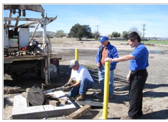
Watermaster operations staff preparing to pump a monitoring well to collect water quality samples

Appropriators, Department of Toxic Substance Control (DTSC), Regional Water Quality Control Board (RWQCB), US Geological Survey (USGS), the Counties, and other cooperators. All water quality data are routinely collected, QA/ QC'd, and loaded into Watermaster's relational database.