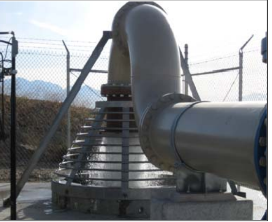
MWD Turnout CB-14